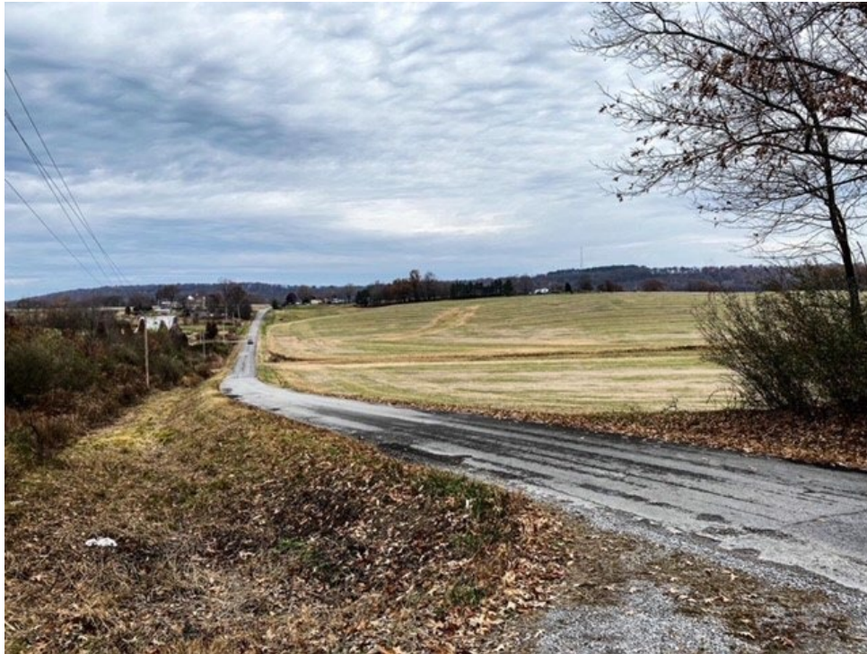
Paved Back Roads!